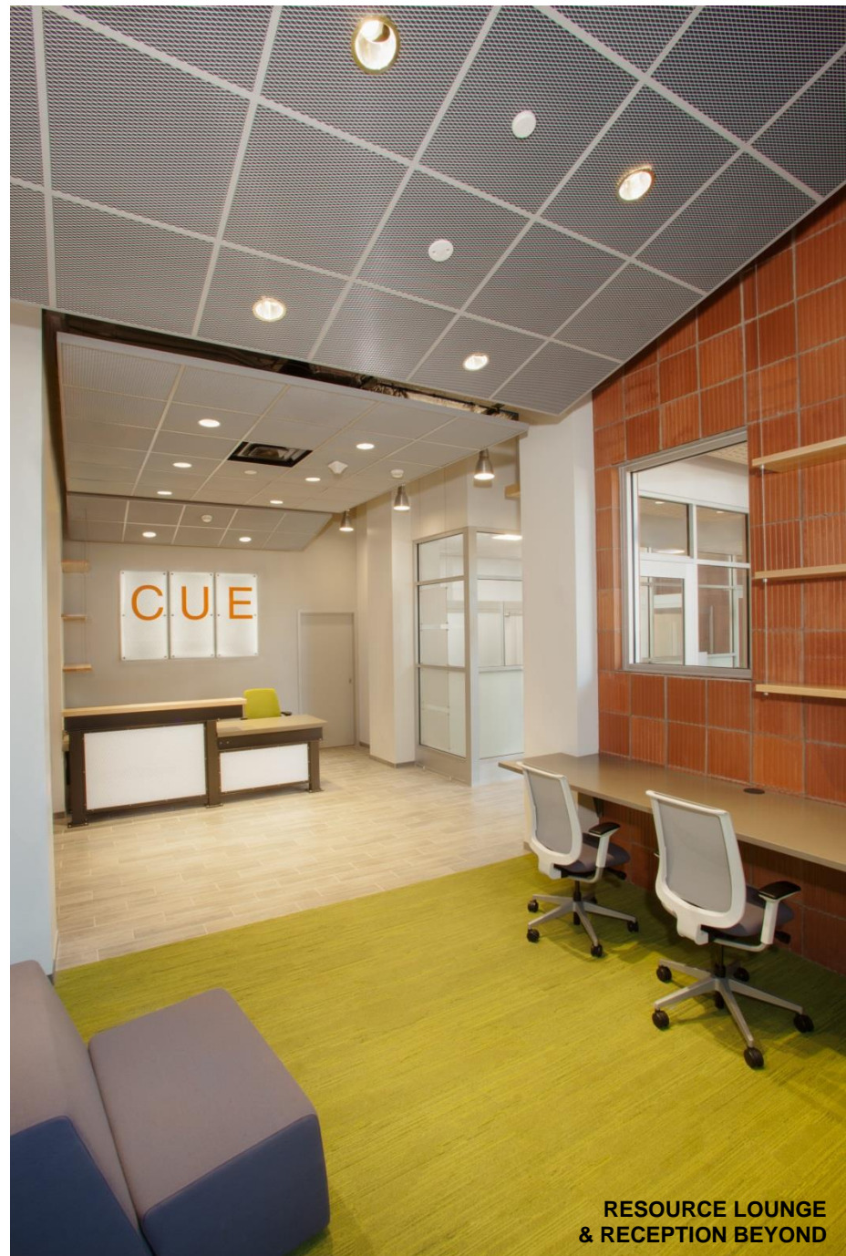
RESOURCE LOUNGE & RECEPTION BEYOND