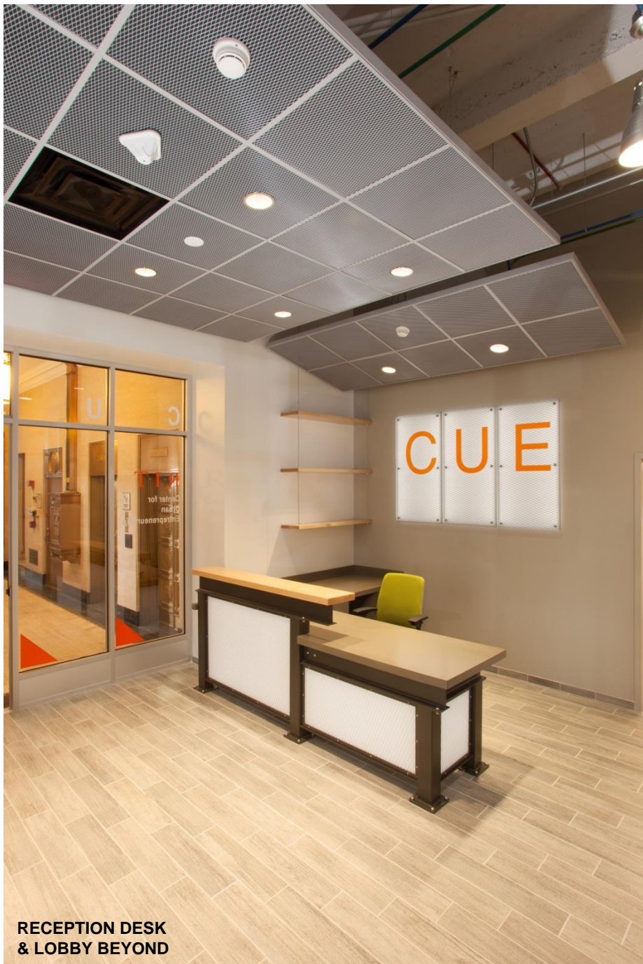
RECEPTION DESK & LOBBY BEYOND