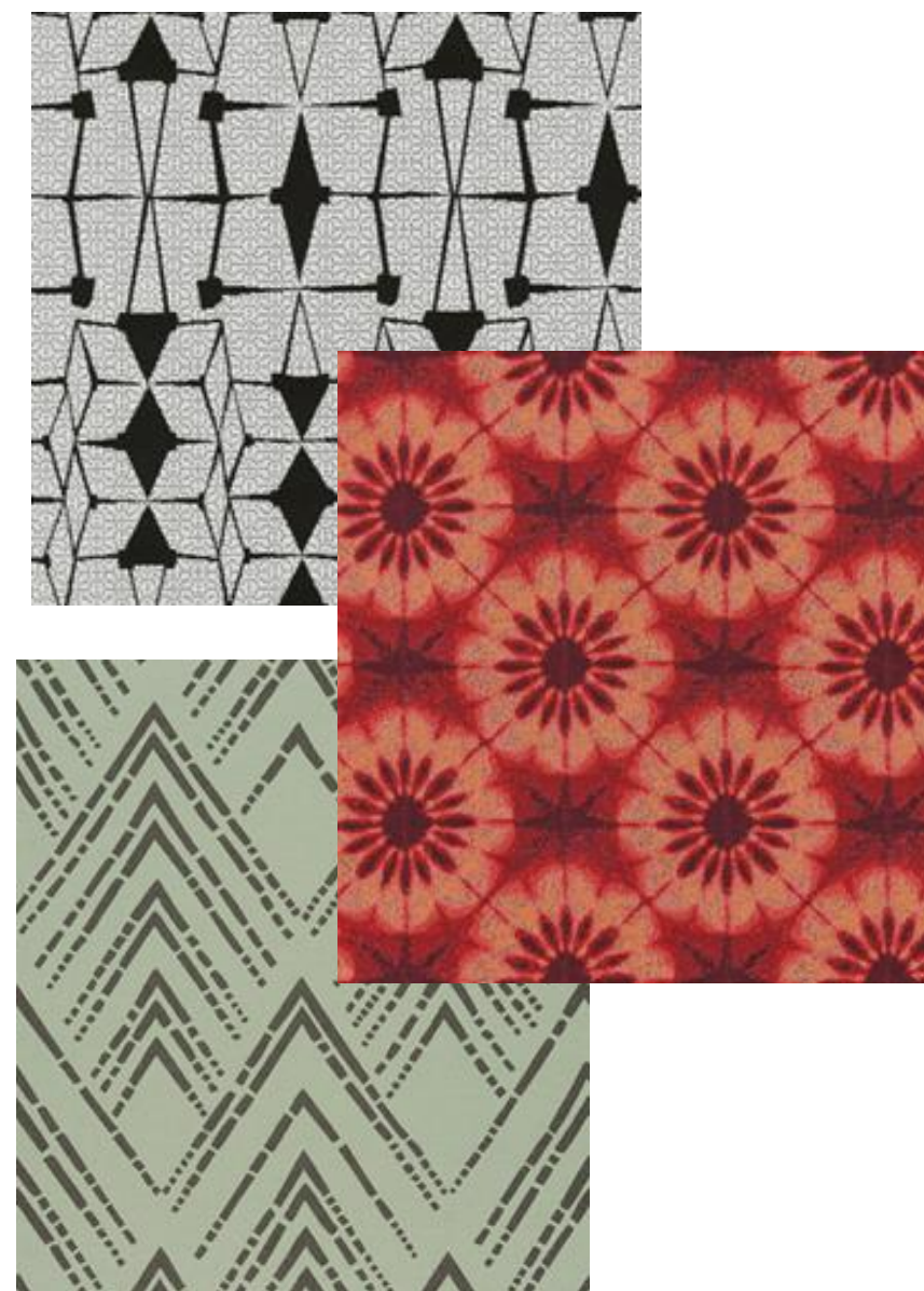
Textiles & Wallcovering