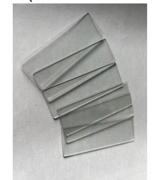
Glass slides applied to sheer fabric overlay